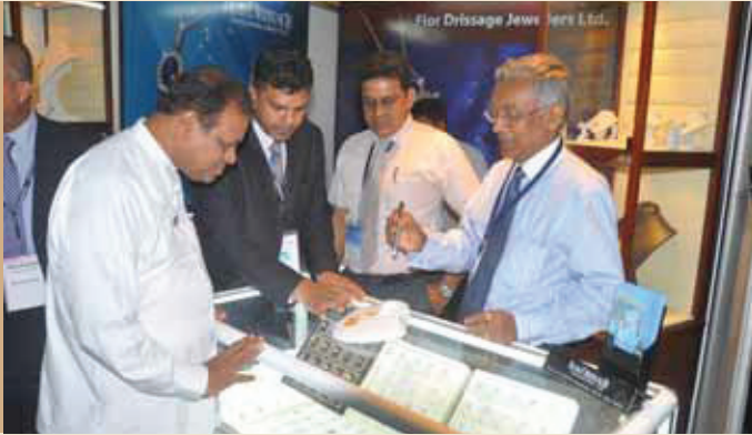
Chief Guest Hon. Susil Premajyantha Minister of Environmental & Renewable Energy at "FACTS" Booth