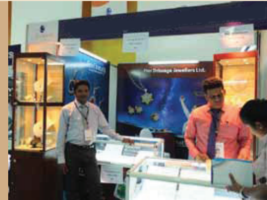
“FACTS” Exhibition - 2014 at BMICH Colombo Sri Lanka