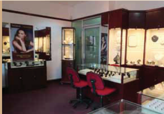
Main showroom at Seeduwa