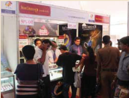
"FACTS" Jewellery Show 2014 - Colombo