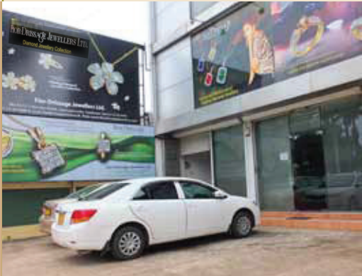
Factory premisses at Seeduwa Katunayake