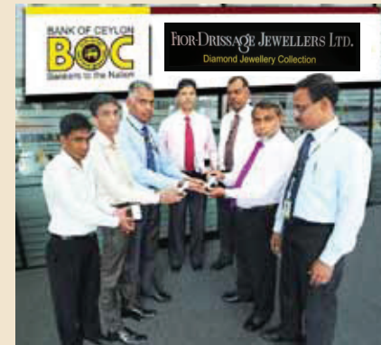
Fior-Drissage Jewellery Promotion through BOC Credit Card