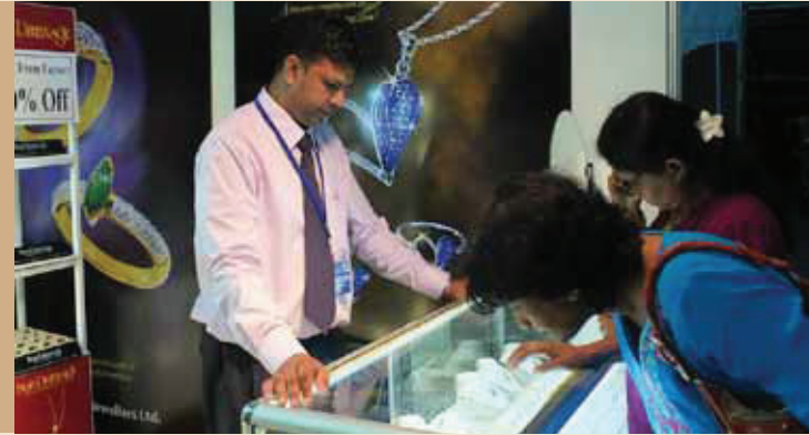
2013 CHOGM Jewellery Exhibition - Colombo